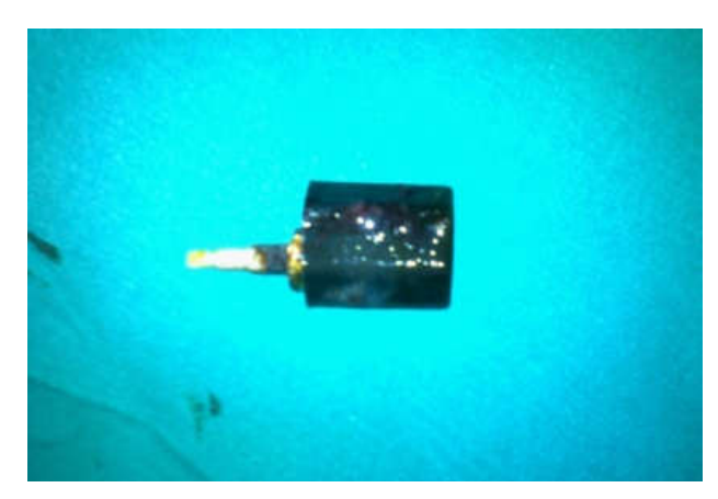
Figure 2. Foreign body after removal...Perfume bottle cap.