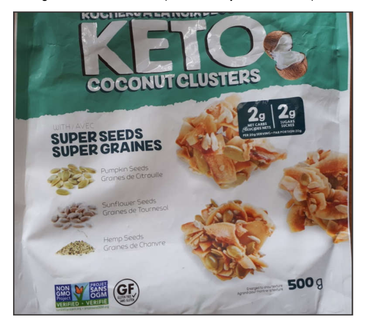
Figure-6: The combination of shelled Hemp seeds, pumpkin, and sunflower seeds ready for the consumption

Hemp seeds (Figure-4, 5, 6) are high in protein, low-carbohydrate, and rich in dietary fiber and unsaturated fatty acids (1-