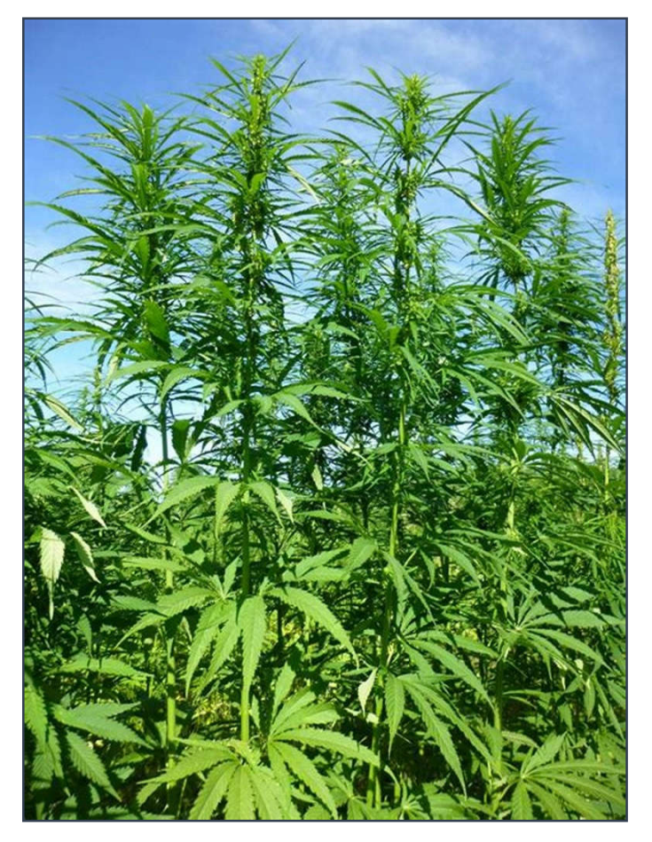
Figure-1: The robust growth of Cannabis sativa (hemp)

woody citrus aroma, while one hybrid C. sativa × C. indica cultivar has a floral citrus aroma due to high amounts of linalool and limonene (4). β-Myrcene was the most abundant compound in most hemp cultivars (4). The main compounds driving the difference between cultivars and sexes were (Z)- and (E)- \beta -ocimene (4). Furthermore, the uses of Cannabis are economically significant, owing to the various food industry applications and the development of therapeutic and pharmacological applications of phytocannabinoids (1-40).