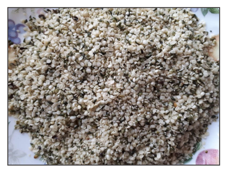
Figure-4: The shelled Hemp Seeds ready for the consumption

Growing awareness regarding the dietary advantages of hempseed (Figure-4, 5, 6) and hempseed oil along with rising demand from the cosmetics and personal care industries will augment the hemp market growth (1-40). The nutritional value of hemp is attracting special attention. Hence, hemp are used in treatment of several human diseases, and these compounds can contribute to cold, heat, and UV radiation tolerance (1-45). Among Cannabis hemp products for skin care, Cannabidiol (CBD) oil with high therapeutic potential and without undesirable psychotropic effects has been extracted from leaves (1-45). The most important phytocannabinoids possess therapeutic, antibacterial, and antimicrobial properties (1-45). The stalks, seeds, and leaves of hemp are converted into various construction materials, textiles, paper, food, furniture, cosmetics, healthcare products (1-36). Nutraceutical- and health-product-based markets are about to grow in the coming years, owing to the increasing awareness about health among end-users (1-50). Several food manufacturing processes make use of hemp seeds and oil, which is expected to propel hemp market growth (1-45). Hemp seed is composed of a white kernel and brown hull (1-45). The kernel is rich in protein, unsaturated fatty acid, and dietary fibre (1-50). Hemp protein is considered as a novel emulsifier in food systems (1-45). The