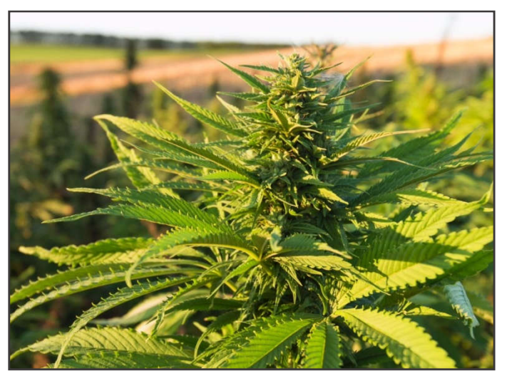
Figure-2: The female inflorescence is the main product of Medical Cannabis sativa (Marijuana or drug type)

(66). The problem with pollination occurring in crops intended for the production of phytocannabinoids is that the energy is shifted to seed production, not Cannabinoid production (66-68). Further pollination resulted in a significant decrease in the overall total phytocannabinoid concentration in inflorescences (66). The THC-rich chemovar female exhibited an average 75% decrease, while CBD-rich females showed a 60% decrease in phytocannabinoid content after fertilization (66). Pollination prevention stimulates the formation of new flowers, increasing phytocannabinoid production (66). Although male plants tend to be larger and bloom before female plants, it is difficult to distinguish them during the vegetative phase (66). The most common way to differentiate female plants from male plants is by analyzing the anatomy of the inflorescences, although some genotypes develop solitary internode flowers at early stages of development, making it possible for early sexual differentiation (66).