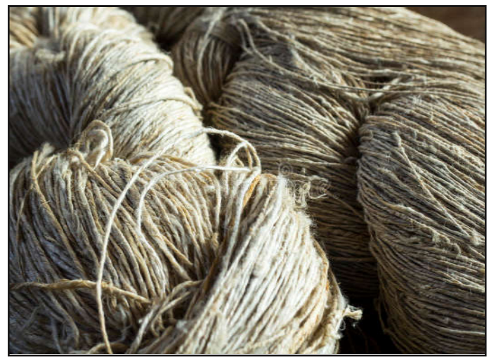
Figure-3: The hemp fibre threads ready for the textile industries

Industrial Cannabis sativa (hemp or fiber type) has been used as inexpensive, eco-friendly, biodegradable hemp plant raw materials to produce cellulose, biofuels, bioethanol, rope, textiles, clothing, biodegradable plastics, paint, insulation, food, animal feed, paper towels, paper plates, ready-made clothes, and even natural fiber shoes (1-60). Rural Indian Himalayan villages have increased the quantity and quality of indigenous Industrial (fiber type) hemp handloom products, such as shawls, stoles, accessories. Increasing production of soaps, shampoos, bath gels, hand and body lotions, UV skin protectors, massage oils , and a range of other hempbased products is expected to have a positive impact on the market growth of Industrial Cannabis sativa (hemp or fiber type) (1-56).