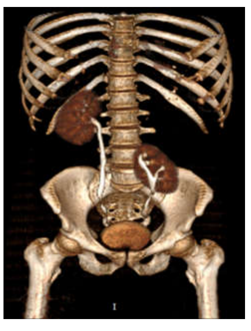
Figure 3: Uro-CTin volume rendering (VR). We note a left renal ectopy with an anomaly of rotation of the hilum

Urolithiasis and renal failure were the most frequent with respectively 52.8% (n=19) and 16.7% (n=6). Two types of non-urological malformations were associated with UM in two patients; these were spina bifida and situs inversus. CT examination was the means of diagnostic confirmation and prognostic evaluation of congenital malformative uropathy in our study.