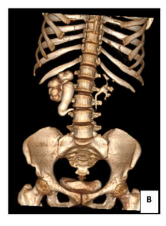
Figure 2: A) Uro-CTin multiplanar reconstruction (MPR) of a right retrocaval ureter (inverse "j" shaped appearance of the ureter); B) Uro-CTin volume rendering (VR) of the retrocaval ureter